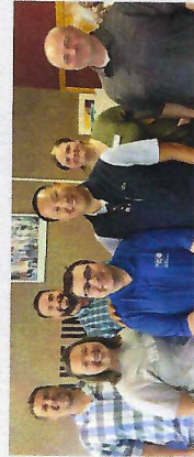
UWNCC Board of Directors

626 Central Ave, Dunkirk, NY unitedwayncc.org 716-366-5424 || info@unitedwayncc.org