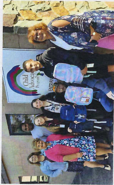
Backpack distribution: Child Advocacy Program

626 Central Ave, Dunkirk, NY unitedwayncc.org 716-366-5424 || info@unitedwayncc.org