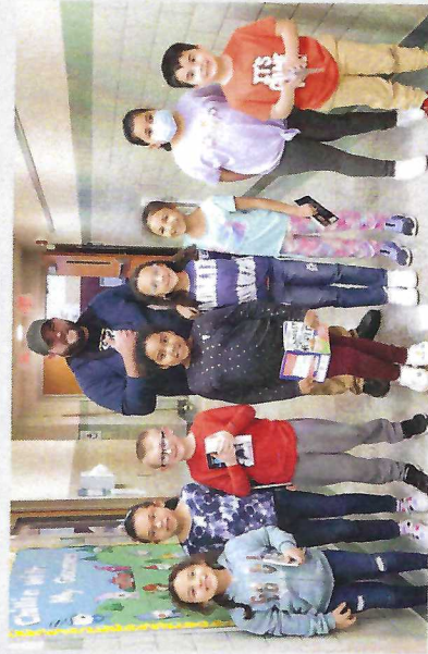
Dunkirk Scouting Program: Rank Advancement & Book Give-away